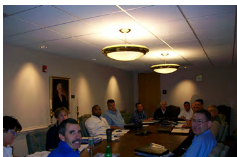
2008 Executive Board