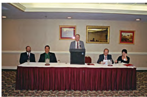
2005 Board Meeting