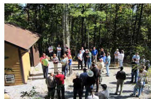
Western Section Meeting at Gorges State Park