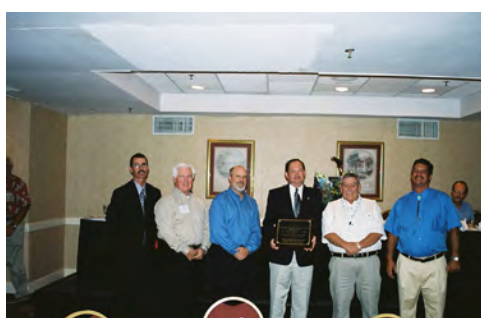
Past Operator of the Year Winners