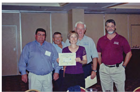
AWOP Award Asheville