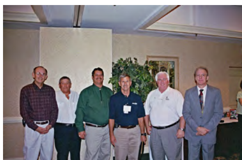
Long time volunteers of NCWOA