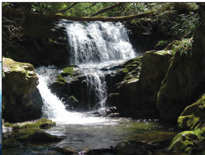
Campbell's Creek - Maggie Valley