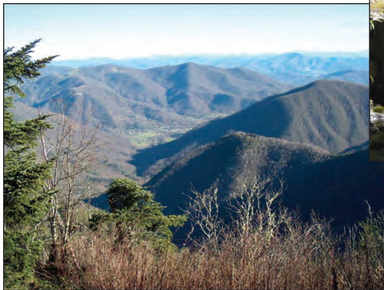
Campbell's Creek Watershed

his co-workers at the district office. Be prepared to stay a while, because you