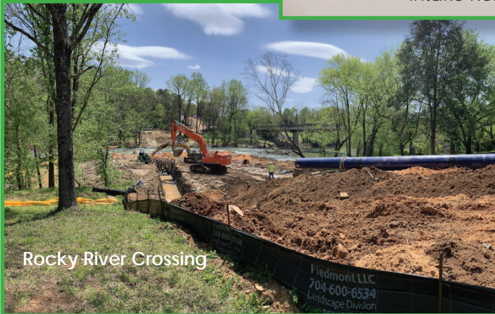
Rocky River Crossing